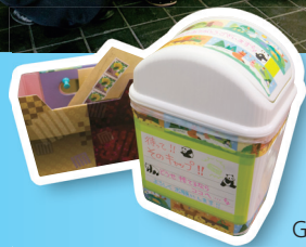
Great cap collecting boxes made by our female employees.