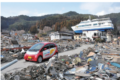
Disaster emergency aid Electric car which was very useful at the affected area (Otsuchi Town, Iwate)