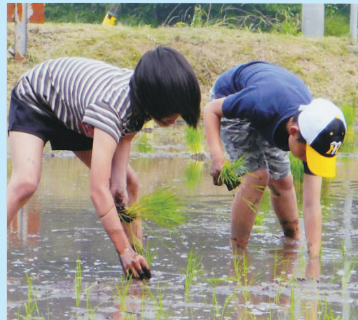
Branch Activity "Children's Rice Paddies"

Each Tendai temple is a branch of Ichigu-wo-Terasu Movement and each temple's chief priest is appointed as branch manager. In other words, the branches are Ichigu-wo-Terasu Movement stations edifying and preaching to sangha members, devotees, and people related to the teachings of Buddha about the Ichigu-wo-Terasu. This is considered as the front-line base. Only when members of Ichigu-wo-Terasu Movement who are our sangha, devotees, and people related to the teachings of Buddha can connect to their temple and share the sense that "this temple is our temple"