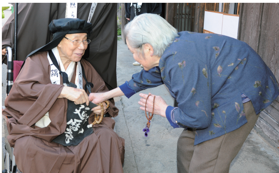
Takuhatsu in Sakamoto District of Otsu City.

These contributions are donated to local, domestic and foreign support programs through Global Relief Fund Office at the Ichigu-wo-Terasu Movement Headquarters, Council of Social Welfare, NHK Year-end Helping Hand Campaign and NHK International Helping Hand Campaign.