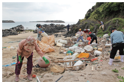
Cleanup activity (Cleaning at Tsushima Coast)