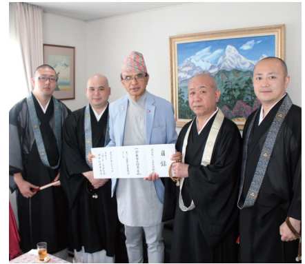
Donation for 2015 Nepal Earthquake Disaster Relief Fund (Embassy of Nepal, Tokyo)