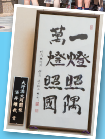
Calligraphy by Sakai Yusai Dai-ajari is displayed too.