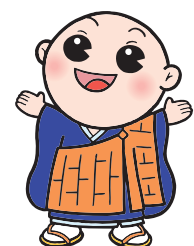
Mascot of Ichigu-wo-Terasu Movement Shogu-san

If more people shed light on ichigu , the world will become a brighter place!