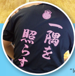
"Ichigo-wo-Terasu" is printed on the back of the uniform.