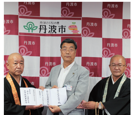
Donation for August 2014 Torrential Rain Disaster Relief Fund (Tamba City, Hyogo)